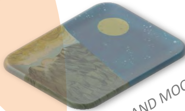
SUN AND MOON