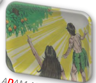
A DAM AND EVE SIN

Example: This is the first event in the story. Copy the letter A to Block 1.