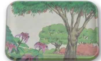
LAND, SEAS, VEGETATI O N