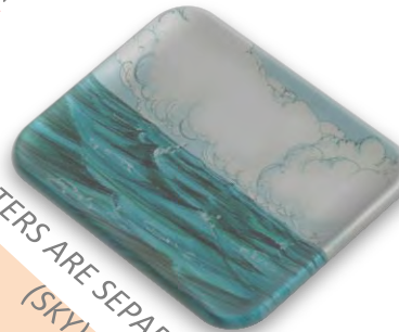
W ATERS ARE SEPARATED (SKY)