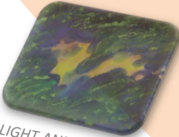
LIGHT AND DARKNE S