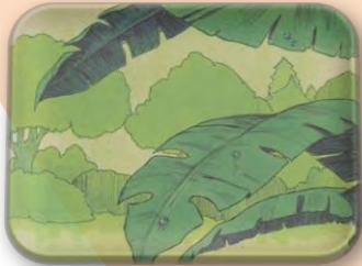
G OD RESTED

Place the pictures from the story of creation in order by entering the red letter from each picture in the correct sequence blocks below.