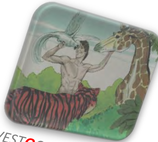
LIVEST O CK AND MAN