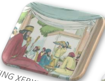
KING XERXES GIVES A BANQUET