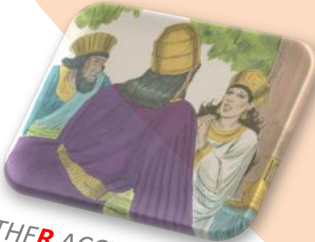
ESTHER ACCUSES HAMAN