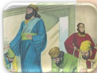
MORDECAI REFUSES TO HONOR HAMAN