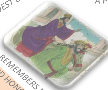
XERES REMEMBERS MORDECAI AND HONORS HIM