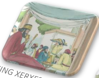
KING XERXES GIVES A BANQUET