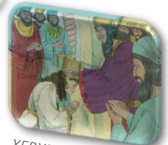
XERXES CHOOSES ESTHER AS QUEEN

Example: This is the first event in the story. Copy the letter A to Block 1.