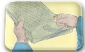
A PROCLAMATION IS MADE AGAINST THE JEWS