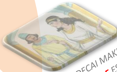
MORDECAI MAKES A REQUEST OF ESTHER