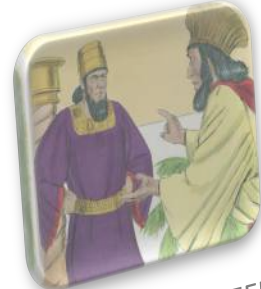
QUEEN VASHTI REFUSES TO ATTEND BANQUET