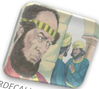
MORDECAI LEARNS OF PLOT