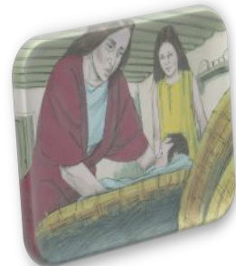
MOSES IS PLACED IN BASKET ON NILE RIVER