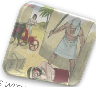
MOSES WITNESSES INJUSTICE