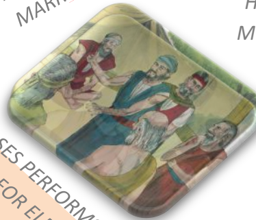
MOSES PERFORMS SIGNS FOR ELDERS