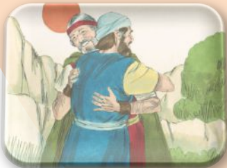
MOSES MEETS AARON

Place the pictures from the story of Moses in order by entering the red letter from each picture in the correct sequence blocks below.