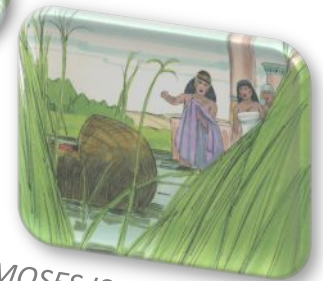
MOSES IS ADOPTED BY PHARAOH'S DAUGHTER

Example: This is the first event in the story. Copy the letter P to Block 1.