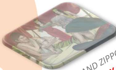
MOSES AND ZIPPORAH MARRY