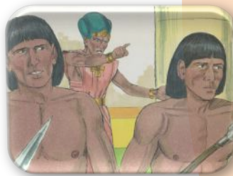
MOSES FLEES TO MIDIAN