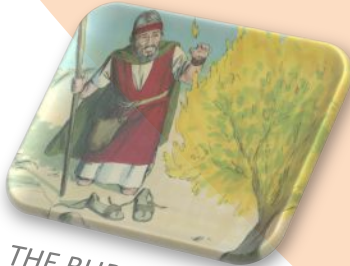
THE BURNING BUSH