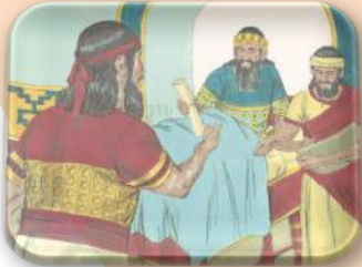
NAAMAN DEPARTS FOR ISRAEL

Place the pictures from the story of Naaman's life in order by entering the red letter from each picture in the correct sequence blocks below.