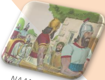
NAAMAN VISITS ELISHA