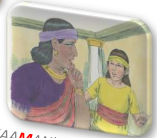
NAAMAN'S WIFE TALKS WITH ISRAELITE GIRL

Example: This is the first event in the story. Copy the letter P to Block 1.