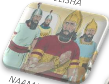
NAAMAN HAS LEPROSY