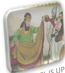
KING OF ISRAEL IS UPSET ON HEARING NAMAAN'S LETTER