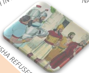
ELISHA REFUSES GIFT