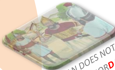
NAAMAN DOES NOT WANT TO WASH IN JORDAN RIVER