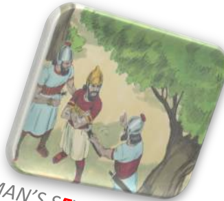
NAAMAN'S SEVANTS CONVINCHE HIM TO DIP SEVEN TIMES