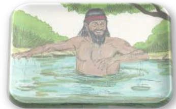
NAMAAN IS HEALED