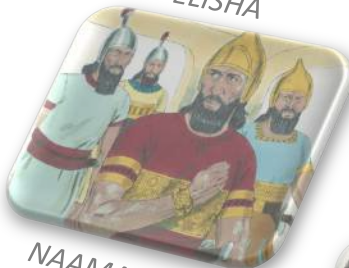
NAAMAN HAS LEPROSY