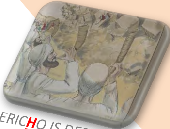
JERICH H O IS DESTROYED