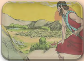
SPIES ENTER JERICH O

Place the pictures from the story of the Promised Land in order by entering the red letter from each picture in the correct sequence blocks below.