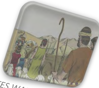
ISRAE L ITES WANDER THE DESERT FOR FORTY YEARS