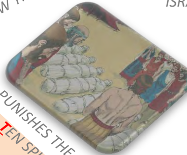
GOD PUNISHES THE OTHER T EN SPIES