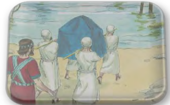
ISRAE L ITES CROSS THE JORDAN