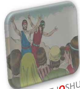
PEOPLE REJECT J O SHUA AND CALEB'S REPORT