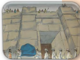
ISRAELITES MARCH AROUND JERICH O FOR S IX DAYS