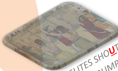
ISRAELITES SHOU T AND BLOW TRUMPETS