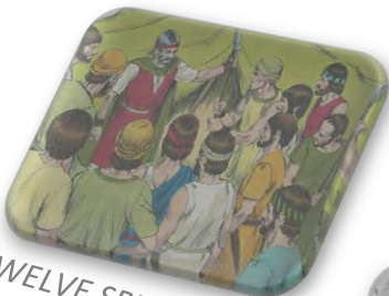
TWELVE SPIES CHOSEN TO EXPL P LOR E LAND