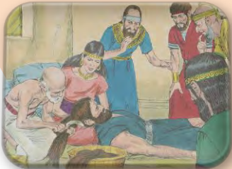
SAMSON IS CAPT U RED

Place the pictures from the story of Samson's life in order by entering the red letter from each picture in the correct sequence blocks below.