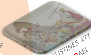
PHILISTINES ATTACK IS R AEL