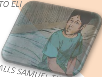
G OD CALLS SAMUEL THE FIRST TIME