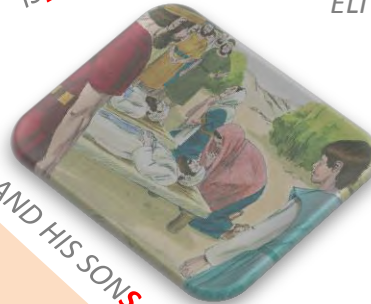
ELI AND HIS SONS S DIE