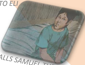
GOD CALLS SAMUEL THE FIRST TIME