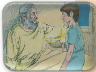
GOD CALLS SAMUEL A THIRD TIME