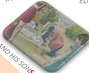
ELI AND HIS SONS DIE