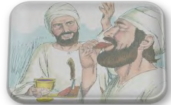
ELI'S SONS DO EVIL IN GOD'S SIGHT