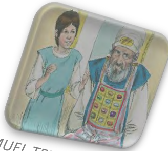
SAMUEL TELLS ELI GOD'S MESSAGE