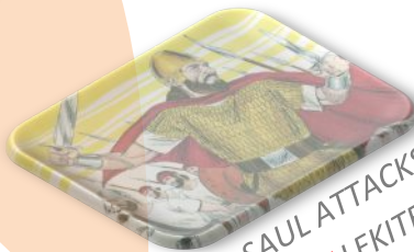
SAUL ATTACKS AMALEKITES