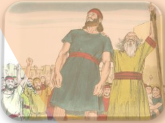
SAUL IS P RESENTED AS KING

Place the pictures from the story of Saul in order by entering the red letter from each picture in the correct sequence blocks below.