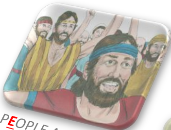
PEOPLE ASK FOR A KING