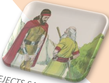
GOD REJECTS SAUL AS KING