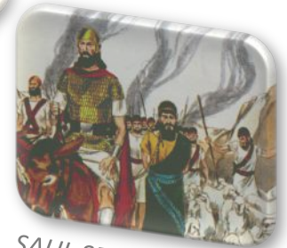
SAUL SPARES BEST SHEEP AND CATTLE

Example: This is the first event in the story. Copy the letter E to Block 1.