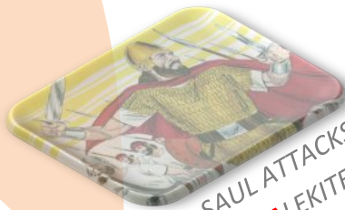
SAUL ATTACKS AMALEKITES