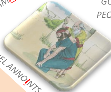
SAMUEL ANNOINTS SAUL