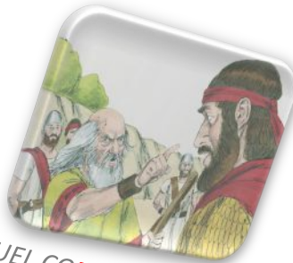
SAMUEL C ONFRONTS SAUL