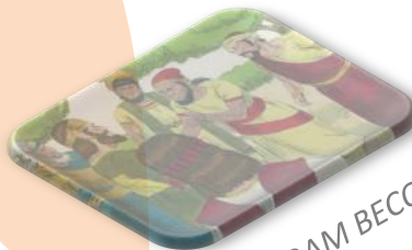
REHOBOAM BECOMES KING