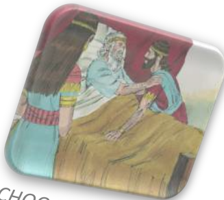
DAVID CHOOSES SOLOMON AS NEXT KING