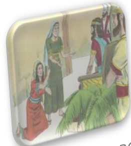
SOLOMON HEARS ARGUMENT BETWEEN TWO WOMEN