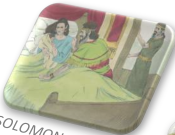
SOLOMON IS BORN