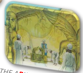
THE ARK IS BROUGHT INTO THE TEMPLE

Example: This is the first event in the story. Copy the letter O to Block 1.