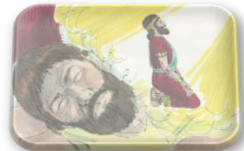
THE LORD APPEARS TO SOLOMON IN A DREAM