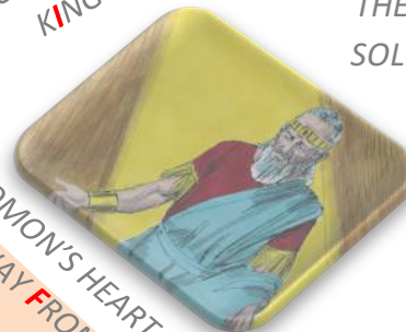
SOLOMON'S HEART TURNS AWAY FROM GOD