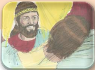
SOLOMON ASKS FOR WISDOM

Place the pictures from the story of Solomon's life in order by entering the red letter from each picture in the correct sequence blocks below.