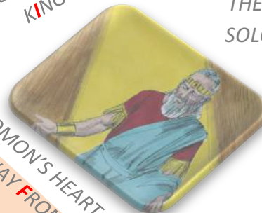
SOLOMON'S HEART TURNS AWAY FROM GOD