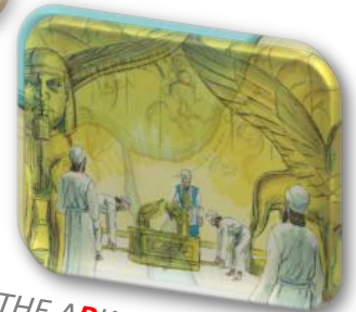
THE ARK IS BROUGHT INTO THE TEMPLE

Example: This is the first event in the story. Copy the letter O to Block 1.