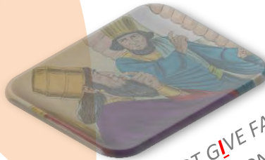
DO NOT GIVE FALSE TESTIMONY