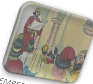
REMEMBER THE SABBATH