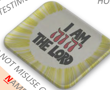
DO NOT MISUSE GOD'S NAME