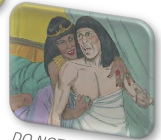
DO NOT COMMIT ADULTERY

Example: This is the first event in the story. Copy the letter W to Block 1.