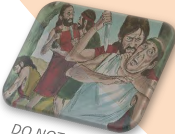
DO NOT MURDER