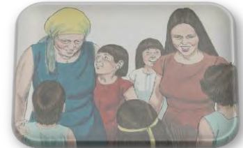
HONOR YOUR FATHER AND MOTHER