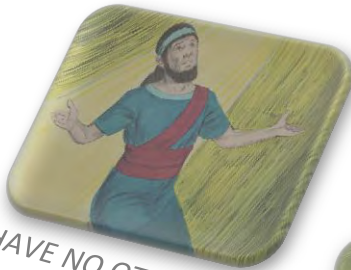
HAVE NO OTHER GODS (WORSHIP GOD ALONE)