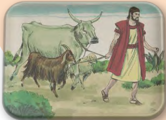
DO NOT COVET

Place the pictures for the Ten Commandments in order by entering the red letter from each picture in the correct sequence blocks below.