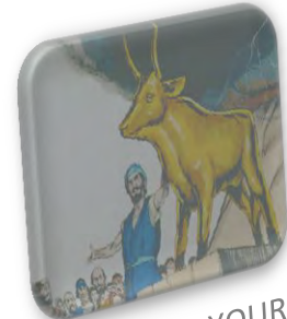
MAKE FOR YOURSELF NO IDOLS