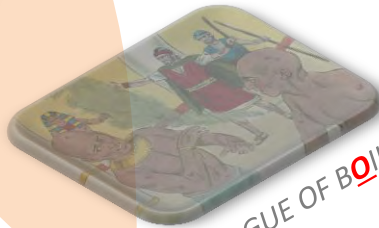
PLAGUE OF B OILS