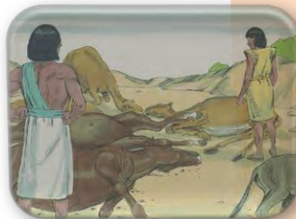
PLAGUE ON L IVESTOCK