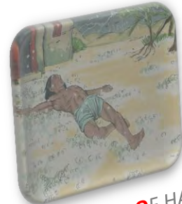
PLAGUE OF H AIL