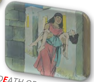
D EATH OF FIRSTBORN

Example: This is the first event in the story. Copy the letter M to Block 1.