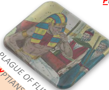
PLAGUE OF FLIES (EG Y PTIANS ONLY)