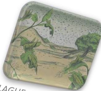
PLAGUE OF LOCUST S