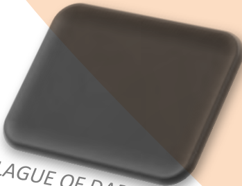
PLAGUE OF DARKNE S S