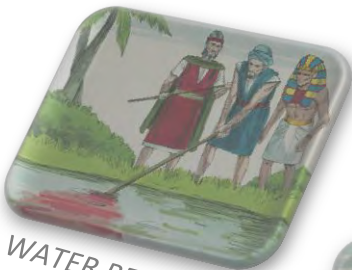
WATER BECOM E S BLOOD