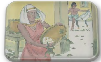
F LAGUE OF FROGS